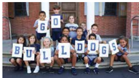
Showing Visitation school spirit

WE MOVE FASTER SO YOU CAN TOO. COME HOME TO THE EXPERTS.