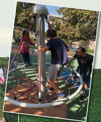
The Ingistovs park-hop on weekends.

Because we want to help you be your best.