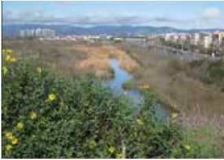
Ballona Freshwater Marsh as seen from Cabrera Drive