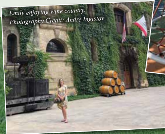
Emily enjoying wine country.

The Ingistov family certainly demonstrates pride in building community literally and figuratively. Their family motto is "Always invest in the future." and they do. ♦