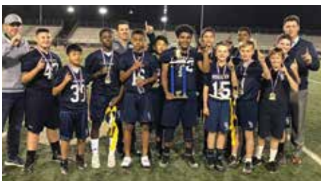
Visitation's 2018 Flag Football Champions

We invite you to stop by to explore our school and our community. Meet with our faculty, chat with our principal, talk with the students and get to know what makes Visitation special— the amazing people within our school. Come by and experience the energy for yourself. Schedule a tour with our front office or join us for Open House on January 30 at 7pm. We look forward to showing you around. ♦